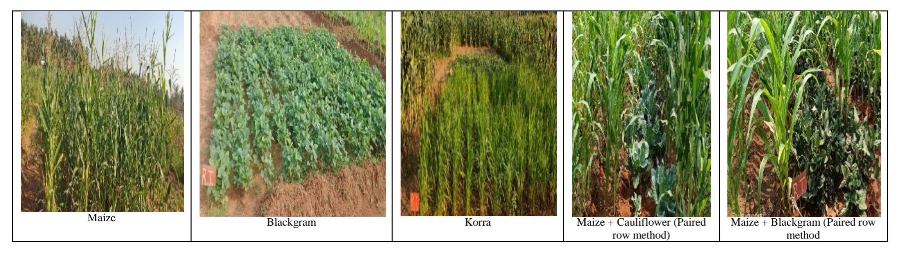
Fig. 2. Maize, Blackgram and Korra during kharif season; Maize intercropped Cauliflower and blackgram in Paired row method during Rabi.